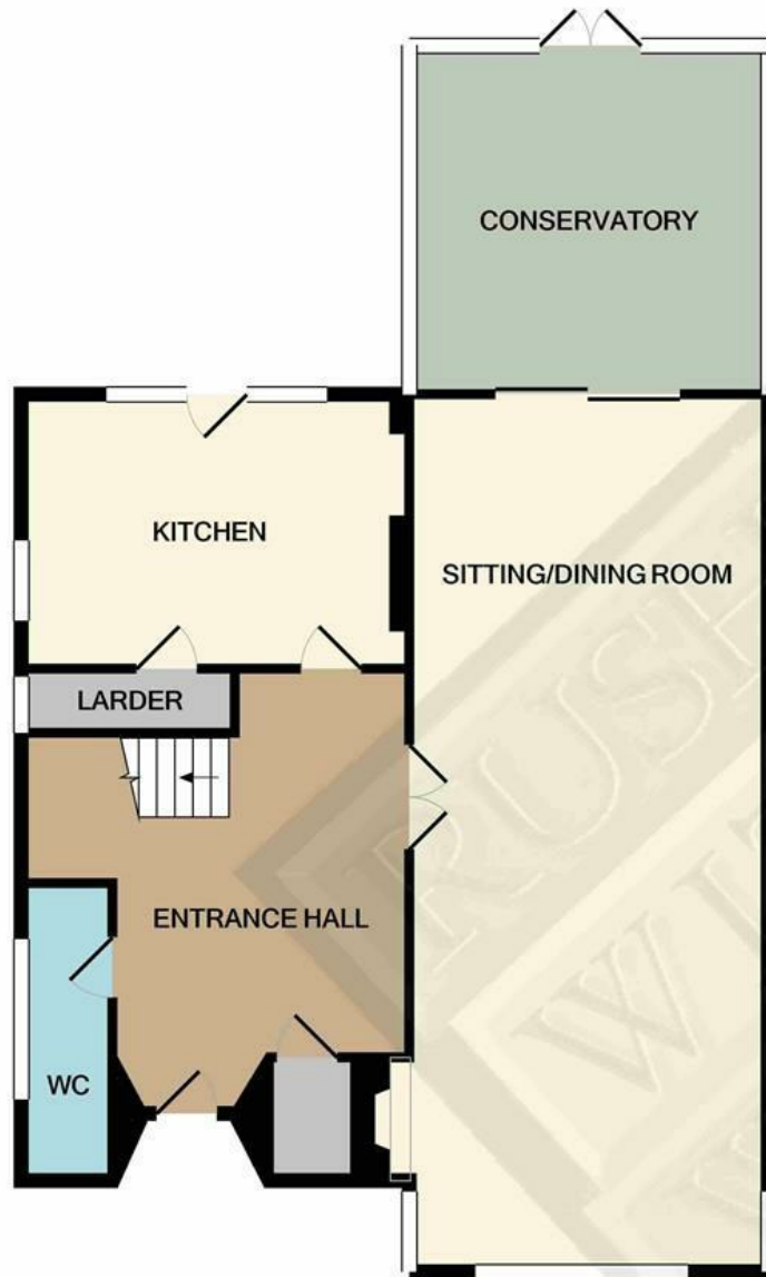
GROUND FLOOR APPROX. FLOOR AREA 783 SQ.FT. (72.8 SQ.M.)